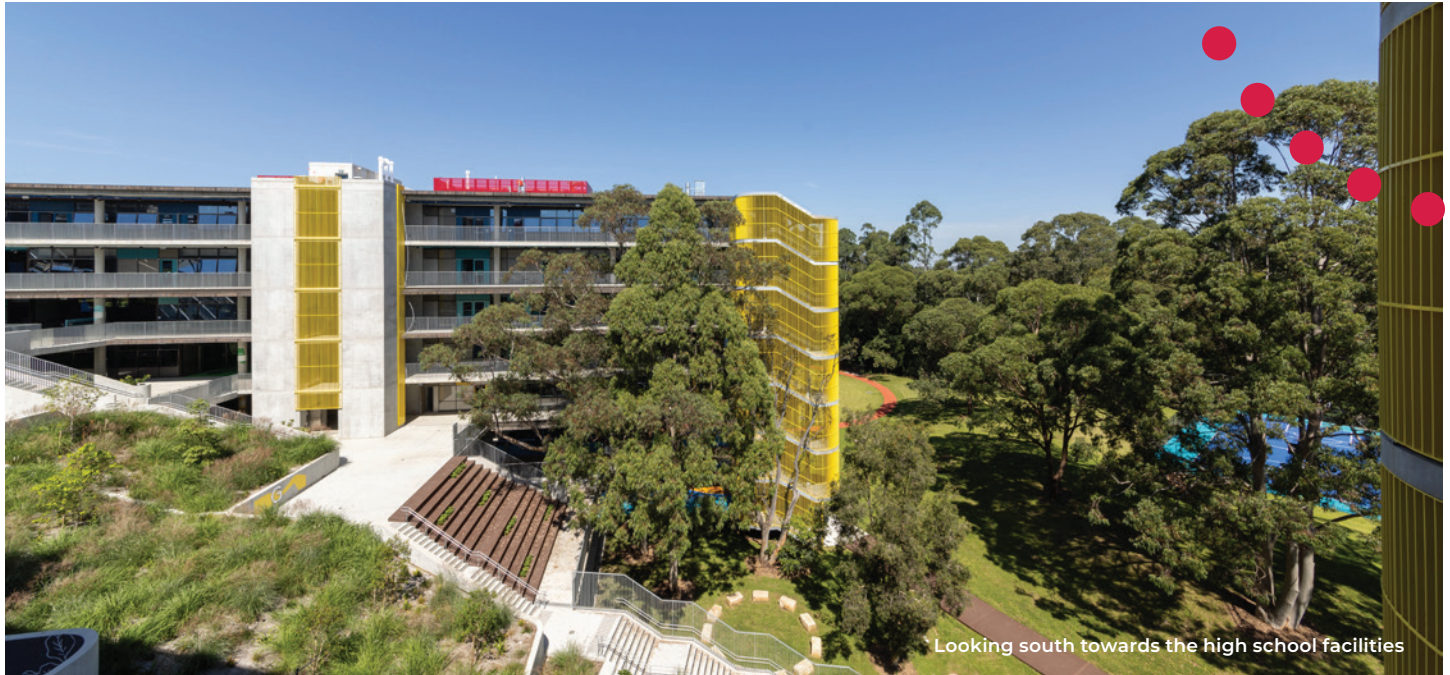
Looking south towards the high school facilities