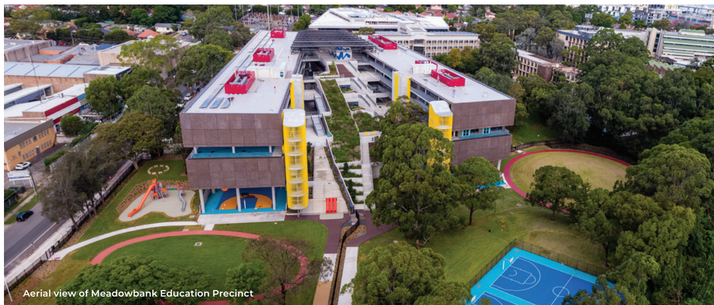
Aerial view of Meadowbank Education Precinct