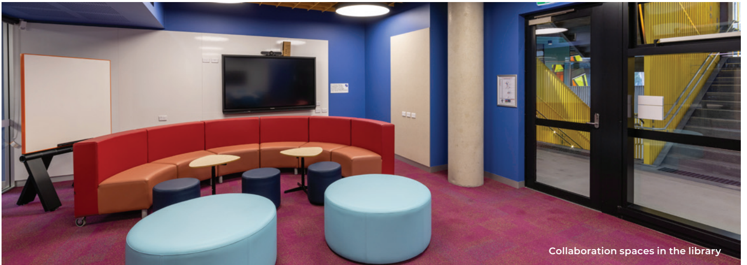
Collaboration spaces in the library