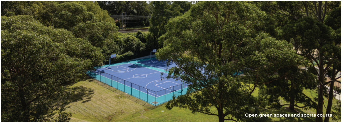
Open green spaces and sports courts