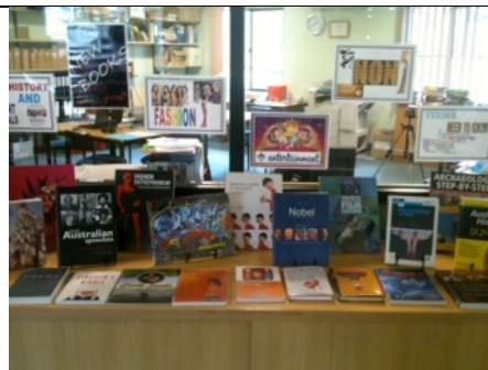
Non Fiction Display

If you haven't already seen the display, come in and ponder the workings of the world and borrow a non fiction text.