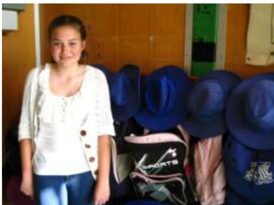
Ruby showed great interest and was very helpful at Public school.