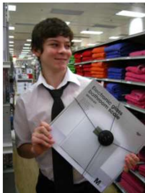
Danny put 'hundreds' of security checks on goods at Target!