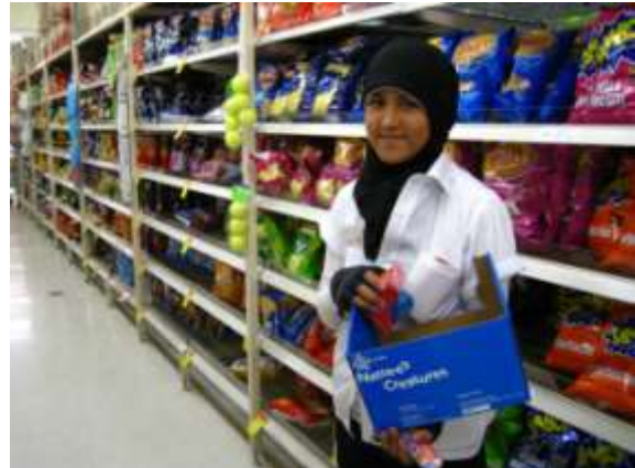
Bibi made a great impression at Woolworths in Auburn.

Below are a few snapshots of some of the students I managed to visit.