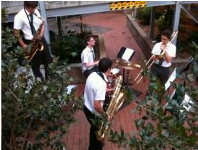
Open Night 'Music in the garden'.

Last week, we opened our school to our community for an impressive Open Night display. Thank you to the enthusiastic staff and our wonderful students who worked together to partake in inspiring activities, the entire display was "awesome". The success of what we do everyday as a part of our business was clearly demonstrated in the way the students went about showing their learning to our guests, in a friendly, engaged manner. I was most impressed. I think every person who visited was enthused by the amazing levels of student learning and the commitment of staff.