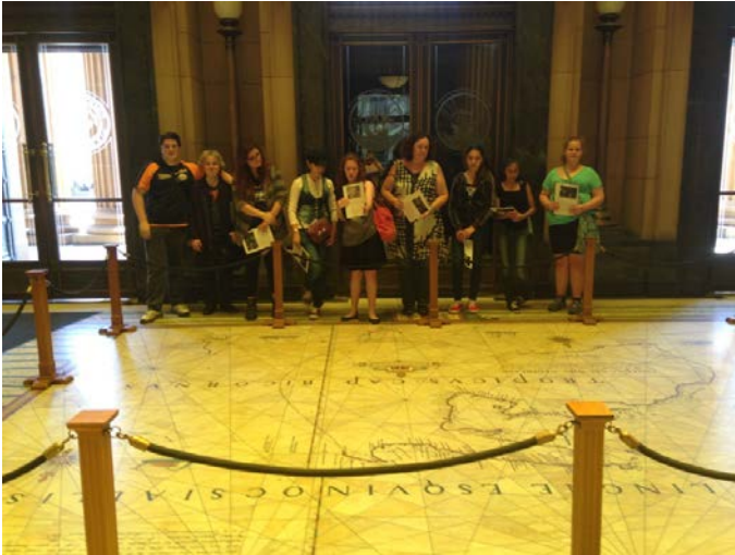
The exhibition dress up box for WW1