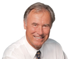
John Alexander Lunch

Marsden's Prefecture Leadership Team was given the opportunity and privilege to meet John Alexander, Federal Member for Bennelong last Friday. The students sat down with John and discussed relevant issues in today's society and were given insight on how particular issues are run in parliament. John and his team presented the PLT with seedlings that can be planted, grown and harvested in teaching students about food, plants and life. Students were able to ask John any questions about parliament and politics and enjoyed the experience.